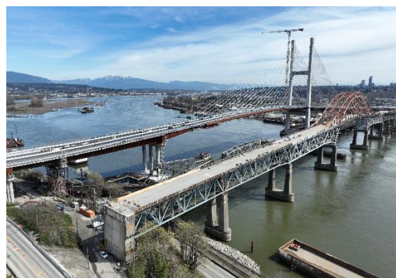
Figure 4: Deconstruction of the Pattullo Bridge north approach in New Westminster.