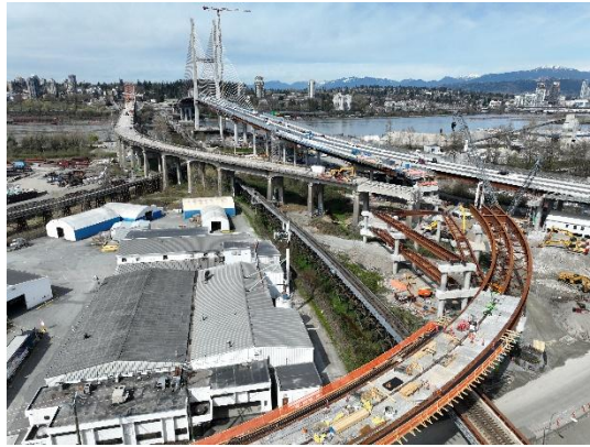
Figure 2: Deconstruction of the Pattullo Bridge south approach in Surrey and Highway 17 off-ramp progress.