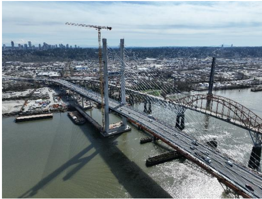
Figure 1: stalōwasəm Bridge.