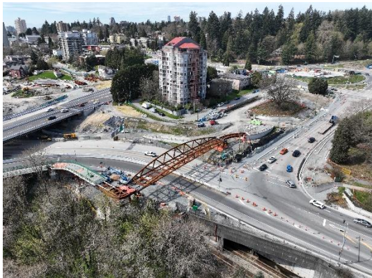
Figure 3: Construction progress on the Columbia multi-use path overpass in New Westminster.