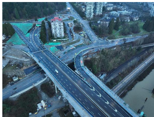
Figure 4: Opening day: North Approach.