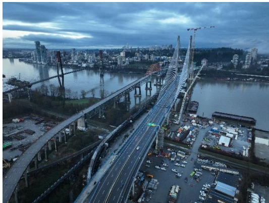
Figure 3: Opening Day: South Approach.