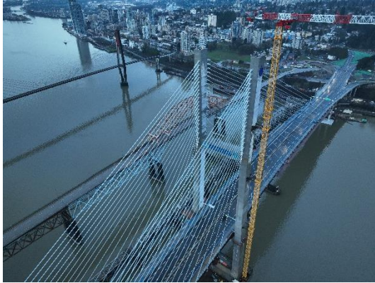
Figure 1: Opening Day: Main span.