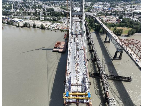
Figure 2: Main span - Bridge finishing works underway.