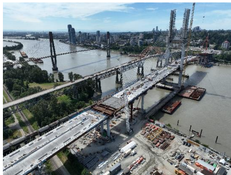
Figure 4: Crews continue to install concrete deck panels on the end span and the bridge finishing activities are underway on the South Approach.