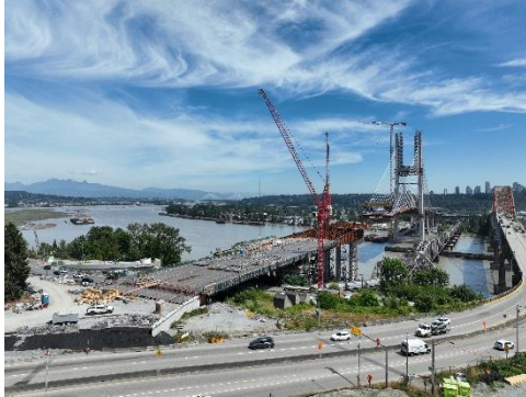
Figure 1: North Approach in New Westminster - Crews continue deck panel and rebar installation and prepare for deck concrete pours.