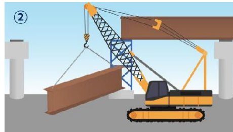
2. The girder is lifted in place to connect the bridge piers. A temporary tower supports the girders as they are safely secured.