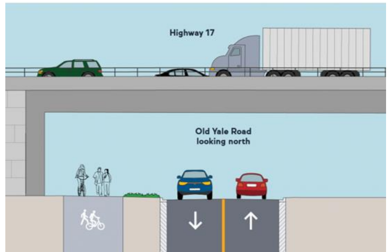
Highway 17 Overpass over Old Yale Road

Overpass installation will be completed in phases. Access to and from Highway 17 via Old Yale Road is being reduced during construction and then fully removed by the final phase of work.