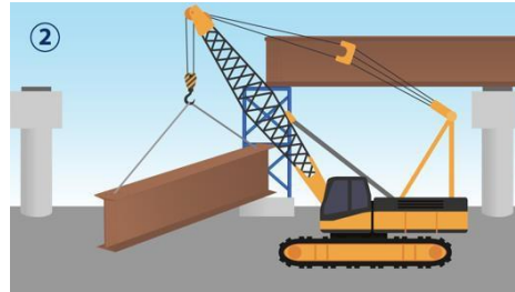
2. The girder is lifted in place to connect the bridge piers. A temporary tower supports the girders as they are safely secured.