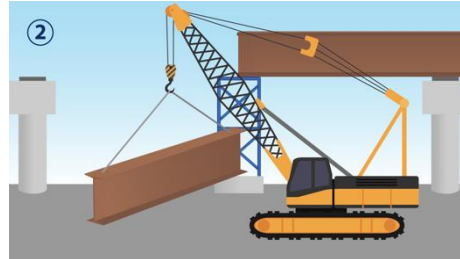
2. The girder is lifted in place to connect the bridge piers. A temporary tower supports the girders as they are safely secured.