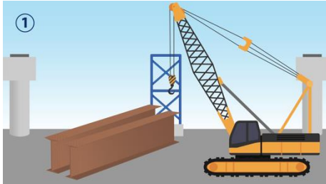
1. A large crane lifts the steel girder.