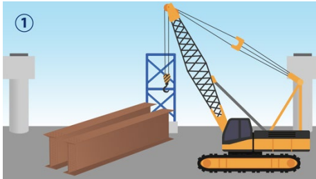
1. A large crane lifts the steel girder.