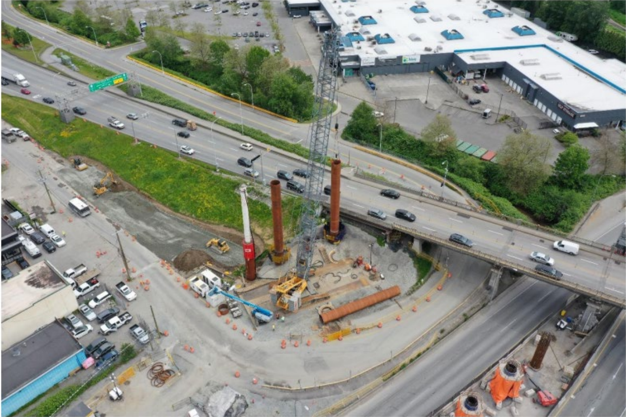
FIGURE 4 – PROGRESS OF THE S8 COLUMNS CONSTRUCTION AND THE SA PILE INSTALLATION