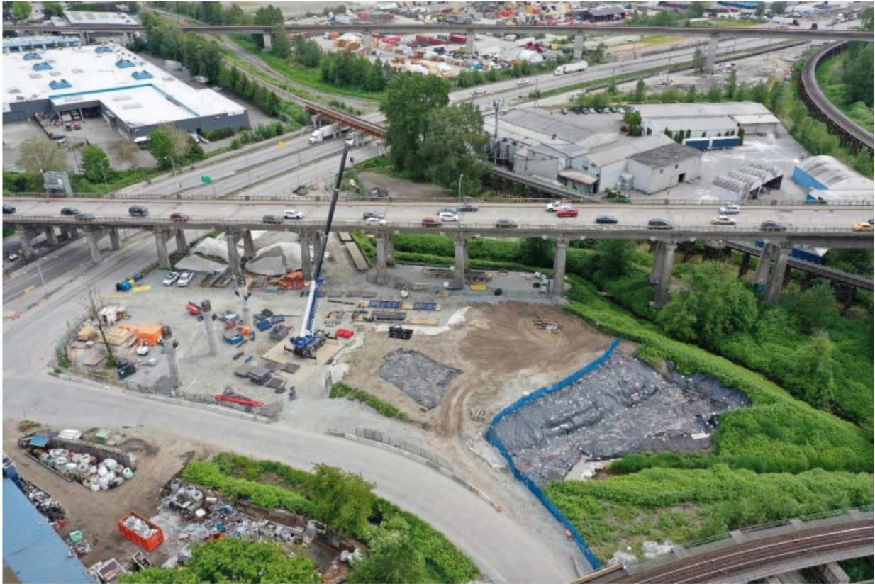
FIGURE 3 – PROGRESS OF THE S7 COLUMNS CONSTRUCTION