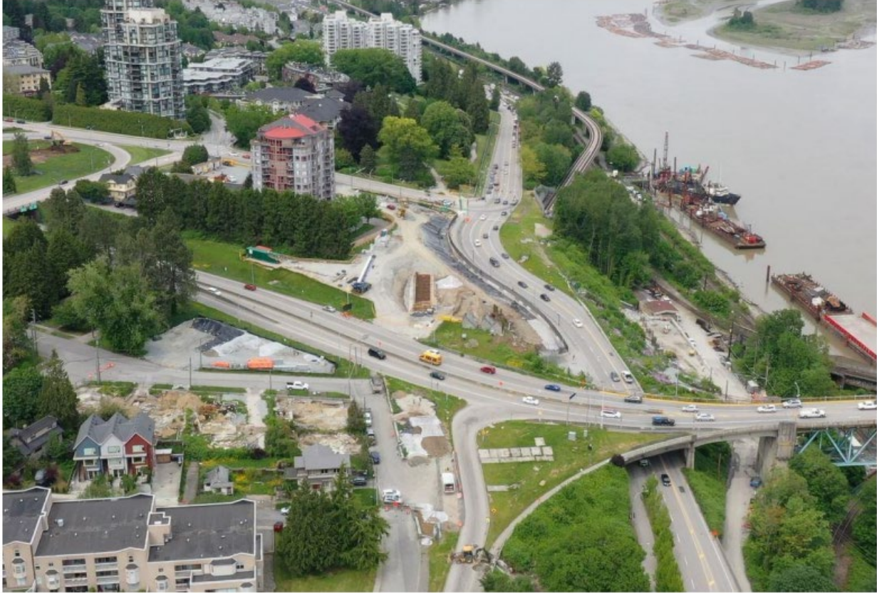
FIGURE 5 – PROGRESS OF THE N3 ABUTMENT FORMWORK