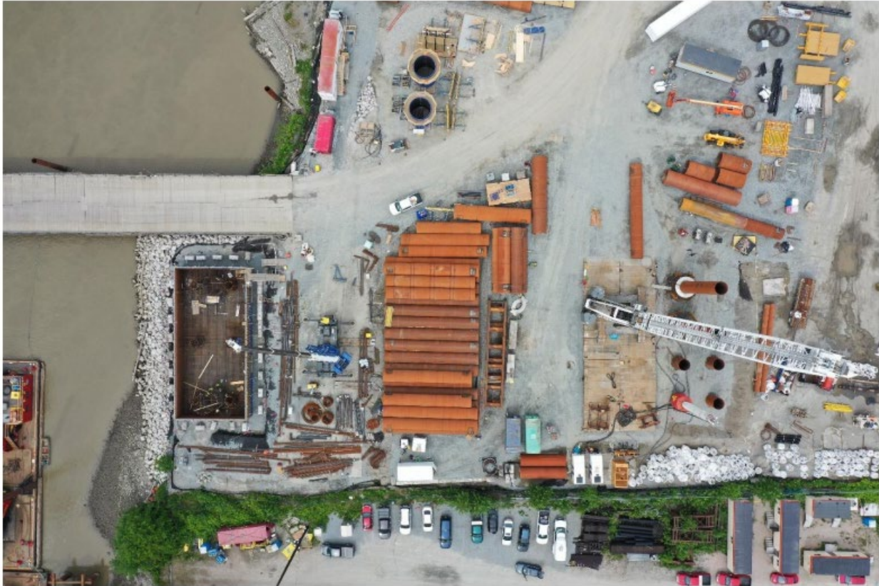
FIGURE 2 –PROGRESS OF THE S2 FORMWORK AND S3 PILE INSTALLATION