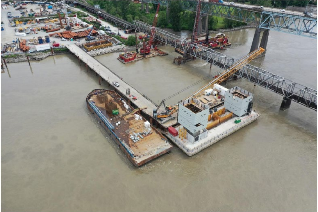
FIGURE 1 – PROGRESS OF THE S1 TOWER CONSTRUCTION