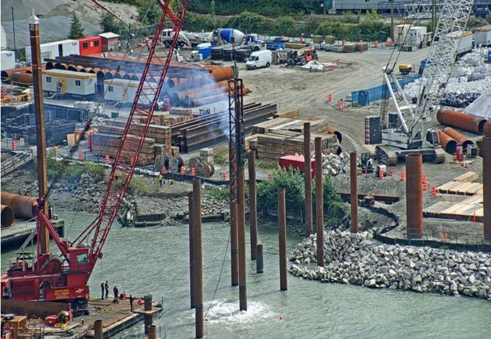
FIGURE 2 – TRESTLE INSTALLATION