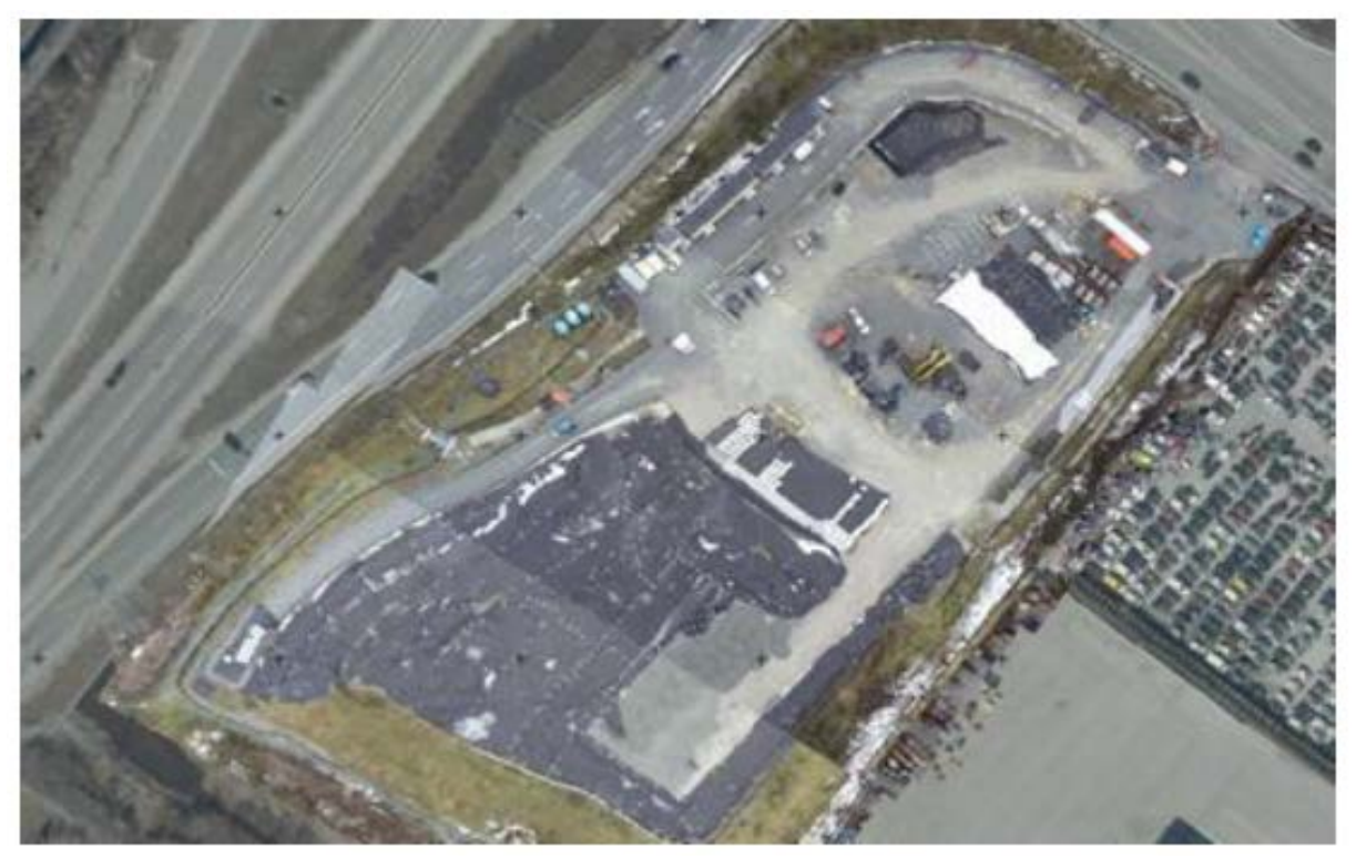
FIGURE 3 – AERIAL VIEW OF TANNERY WORK AREA IN SURREY, B.C.