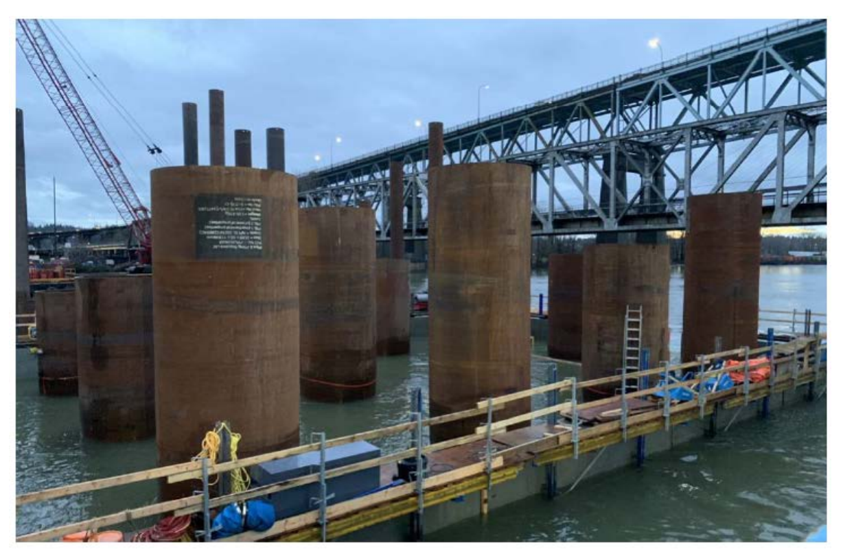
FIGURE 2 –INSTALLATION OF COLLARS AND PRECAST SHELL AT PIER S1