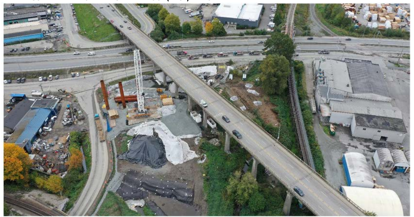
FIGURE 2 – PILE INSTALLATION AT PIER S7