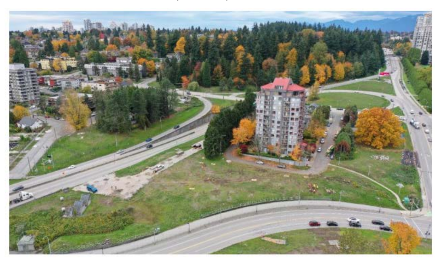
FIGURE 4 – WORK AREA SET UP AT PIER N3 IN NEW WESTMINSTER