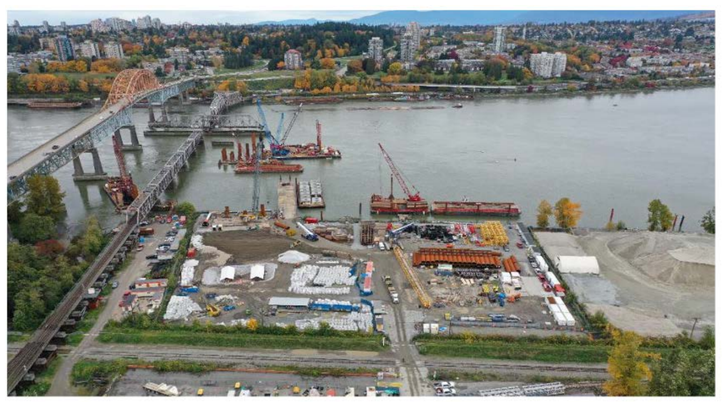
FIGURE 1 – PILE INSTALLATION AT PIERS S1 (BACK) AND S2